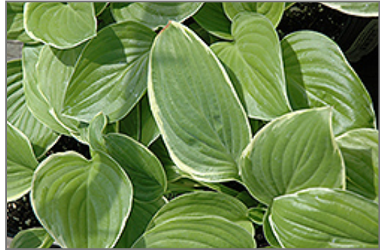
Frozen Margarita Hosta foliage

Frozen Margarita Hosta is recommended for the following landscape applications;