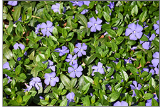
Dart's Blue Periwinkle flowers