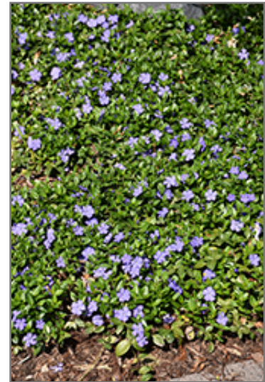
Dart's Blue Periwinkle in bloom