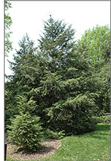
Canadian Hemlock