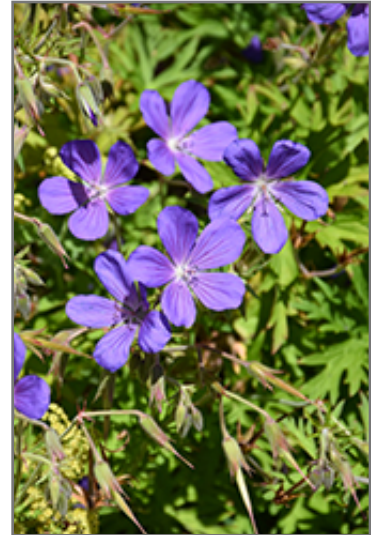
Orion Cranesbill flowers