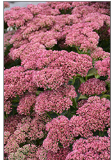
Autumn Fire Stonecrop flowers

This is a relatively low maintenance plant, and is best cleaned up in early spring before it resumes active growth for the season. It is a good choice for attracting bees and butterflies to your yard, but is not particularly attractive to deer who tend to leave it alone in favor of tastier treats. It has no significant negative characteristics.