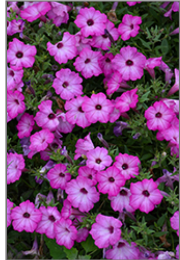
Supertunia Tiara Pink Petunia flowers

This plant will require occasional maintenance and upkeep. Trim off the flower heads after they fade and die to encourage more blooms late into the season. It is a good choice for attracting butterflies and hummingbirds to your yard, but is not particularly attractive to deer who tend to leave it alone in favor of tastier treats. It has no significant negative characteristics.