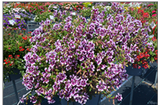
Sweet Talk Lavender Splash Cuphea in bloom