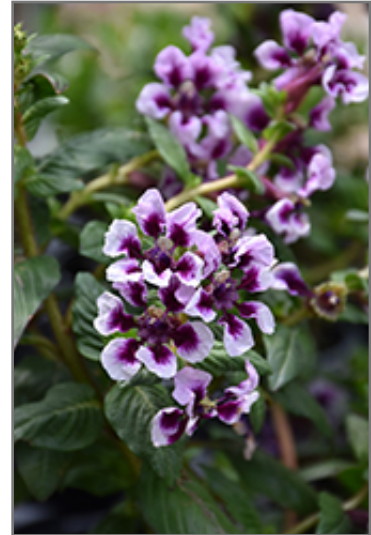
Sweet Talk Lavender Splash Cuphea flowers

This is a relatively low maintenance plant, and is best cleaned up in early spring before it resumes active growth for the season. It is a good choice for attracting butterflies and hummingbirds to your yard. It has no significant negative characteristics.