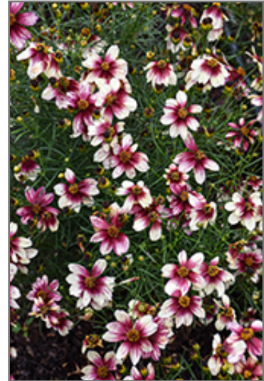
Sizzle And SpiceZesty Zinger Tickseed flowers

Sizzle And SpiceZesty Zinger Tickseed is recommended for the following landscape applications;