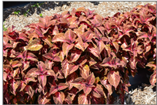
Main Street Sunset Boulevard Coleus