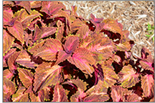
Main Street Sunset Boulevard Coleus foliage

This is a relatively low maintenance plant. The flowers of this plant may actually detract from its ornamental features, so they can be removed as they appear. Deer don't particularly care for this plant and will usually leave it alone in favor of tastier treats. It has no significant negative characteristics.