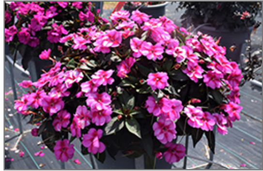
SunPatiens Compact Purple Candy Impatiens in bloom

SunPatiens Compact Purple Candy Impatiens is a fine choice for the garden, but it is also a good selection for planting in outdoor containers and hanging baskets. It can be used either as 'filler' or as a 'thriller' in the 'spiller-thriller-filler' container combination, depending on the height and form of the other plants used in the container planting. It is even sizeable enough that it can be grown alone in a suitable container. Note that when growing plants in outdoor containers and baskets, they may require more frequent waterings than they would in the yard or garden.