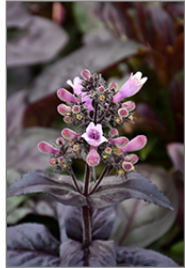
Dakota Burgundy Beard Tongue flowers

Dakota Burgundy Beard Tongue is an herbaceous perennial with an upright spreading habit of growth. Its medium texture blends into the garden, but can always be balanced by a couple of finer or coarser plants for an effective composition.