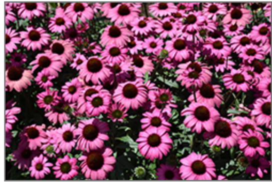
Prima Berry Coneflower flowers

Prima Berry Coneflower is recommended for the following landscape applications;