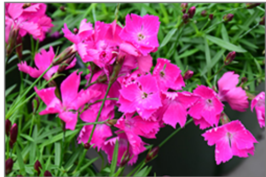
Beauties Kahori Pinks flowers