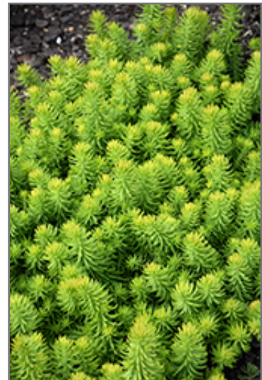
Prima Angelina Stonecrop