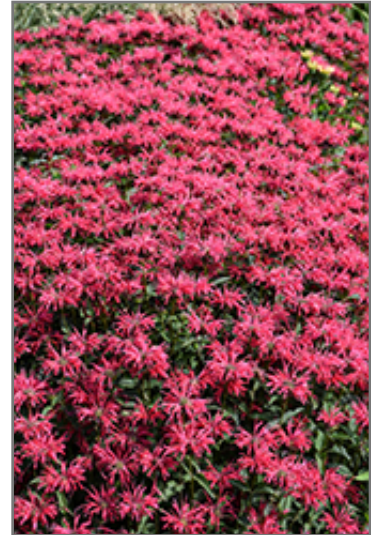
Upscale Red Velvet Beebalm flowers

Upscale Red Velvet Beebalm is a fine choice for the garden, but it is also a good selection for planting in outdoor pots and containers. Because of its height, it is often used as a 'thriller' in the 'spiller-thriller-filler' container combination; plant it near the center of the pot, surrounded by smaller plants and those that spill over the edges. It is even sizeable enough that it can be grown alone in a suitable container. Note that when growing plants in outdoor containers and baskets, they may require more frequent waterings than they would in the yard or garden.