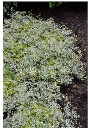
Golden Feathers Jacob's Ladder foliage