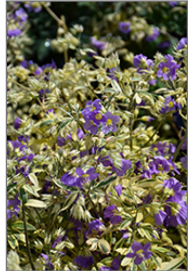
Golden Feathers Jacob's Ladder flowers

Golden Feathers Jacob's Ladder is recommended for the following landscape applications;