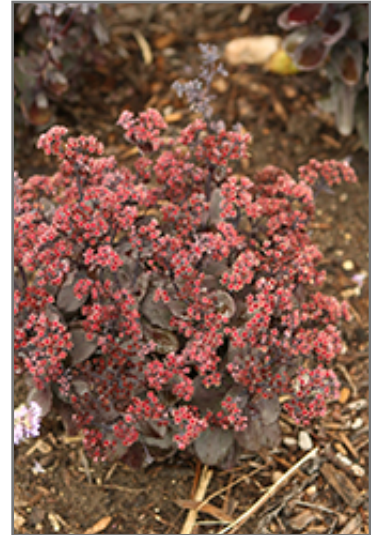
Rock 'N Grow Back in Black Stonecrop flowers

Rock 'N Grow Back in Black Stonecrop is a fine choice for the garden, but it is also a good selection for planting in outdoor pots and containers. With its upright habit of growth, it is best suited for use as a 'thriller' in the 'spiller-thriller-filler' container combination; plant it near the center of the pot, surrounded by smaller plants and those that spill over the edges. Note that when growing plants in outdoor containers and baskets, they may require more frequent waterings than they would in the yard or garden.