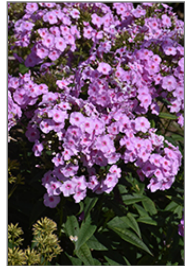
Luminary Opalescence Garden Phlox flowers

Luminary Opalescence Garden Phlox is recommended for the following landscape applications;