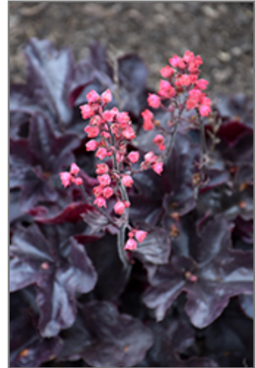
Black Forest Cake Coral Bells flowers

Black Forest Cake Coral Bells is recommended for the following landscape applications;