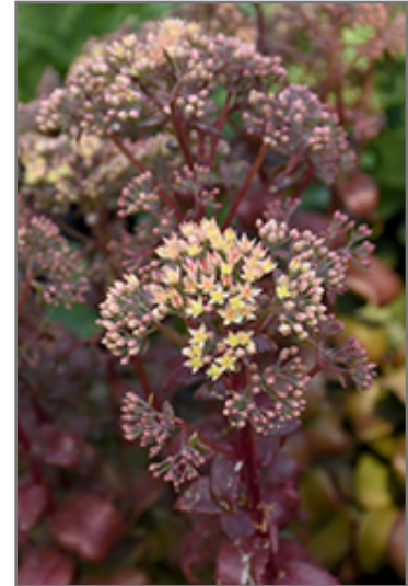
Peach Pearls Stonecrop flowers

Peach Pearls Stonecrop is recommended for the following landscape applications;