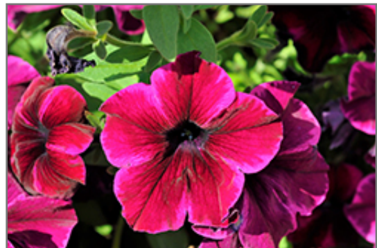
Crazytunia Cosmic Purple Petunia flowers