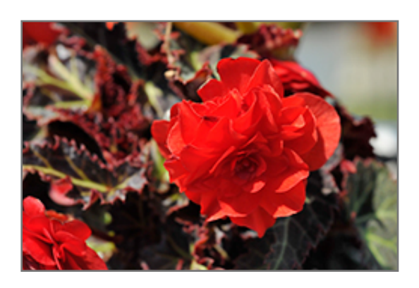
I'Conia Red Begonia flowers

A beautiful vigorous, semi-trailing variety ideal for patio containers and hanging baskets; featuring large, vibrant red double blooms nestled on top of deep and dark green foliage with black overtones; low maintenance, deadhead to encourage new growth