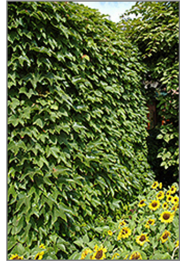
Boston Ivy

This woody vine does best in full sun to partial shade. It is very adaptable to both dry and moist locations, and should do just fine under average home landscape conditions. It is considered to be drought-tolerant, and thus makes an ideal choice for xeriscaping or the moisture-conserving landscape. It is not particular as to soil type or pH, and is able to handle environmental salt. It is highly tolerant of urban pollution and will even thrive in inner city environments. This species is not originally from North America.