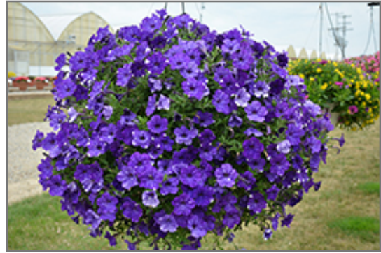
Headliner Night Sky Petunia in bloom

Headliner Night Sky Petunia will grow to be about 16 inches tall at maturity, with a spread of 30 inches. When grown in masses or used as a bedding plant, individual plants should be spaced approximately 24 inches apart. Its foliage tends to remain dense right to the ground, not requiring facer plants in front. This fast-growing annual will normally live for one full growing season, needing replacement the following year.