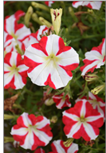
Amore King of Hearts Petunia flowers