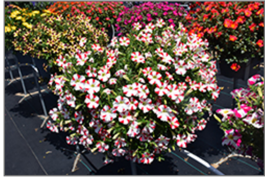
Amore King of Hearts Petunia in bloom

Amore King of Hearts Petunia will grow to be about 12 inches tall at maturity, with a spread of 14 inches. When grown in masses or used as a bedding plant, individual plants should be spaced approximately 10 inches apart. Its foliage tends to remain dense right to the ground, not requiring facer plants in front. This fast-growing annual will normally live for one full growing season, needing replacement the following year.