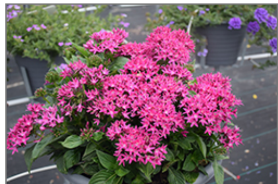
Sunstar Lavender Egyptian Star Flower in bloom