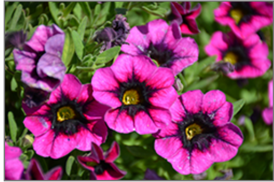
Superbells Blackcurrent Punch Calibrachoa flowers