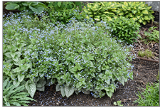
Queen of Hearts Bugloss in bloom

Queen of Hearts Bugloss is recommended for the following landscape applications;