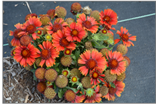
SpinTop Yellow Touch Blanket Flower in bloom

SpinTop Yellow Touch Blanket Flower is a fine choice for the garden, but it is also a good selection for planting in outdoor pots and containers. It is often used as a 'filler' in the 'spiller-thriller-filler' container combination, providing a mass of flowers against which the thriller plants stand out. Note that when growing plants in outdoor containers and baskets, they may require more frequent waterings than they would in the yard or garden.