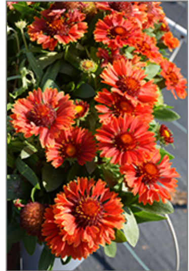
SpinTop Yellow Touch Blanket Flower flowers

SpinTop Yellow Touch Blanket Flower is a dense herbaceous perennial with a mounded form. Its relatively fine texture sets it apart from other garden plants with less refined foliage.