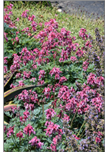
Pink Diamonds Fern-leaved Bleeding Heart flowers

Pink Diamonds Fern-leaved Bleeding Heart is an herbaceous perennial with a mounded form. It brings an extremely fine and delicate texture to the garden composition and should be used to full effect.