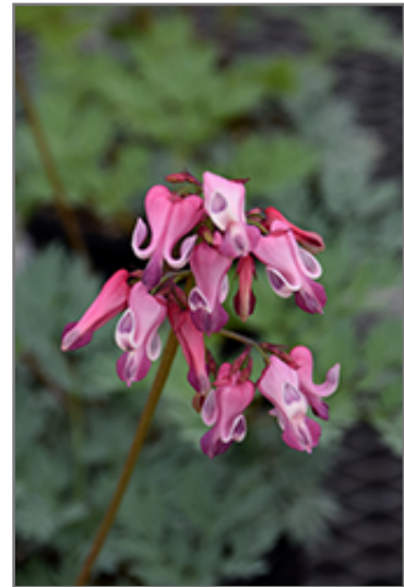
Pink Diamonds Fern-leaved Bleeding Heart flowers

Pink Diamonds Fern-leaved Bleeding Heart is a fine choice for the garden, but it is also a good selection for planting in outdoor pots and containers. It is often used as a 'filler' in the 'spiller-thriller-filler' container combination, providing a mass of flowers and foliage against which the thriller plants stand out. Note that when growing plants in outdoor containers and baskets, they may require more frequent waterings than they would in the yard or garden.