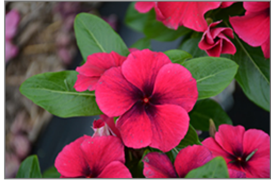
Tattoo Black Cherry Vinca flowers

This plant will require occasional maintenance and upkeep, and should not require much pruning, except when necessary, such as to remove dieback. It is a good choice for attracting butterflies to your yard, but is not particularly attractive to deer who tend to leave it alone in favor of tastier treats. It has no significant negative characteristics.