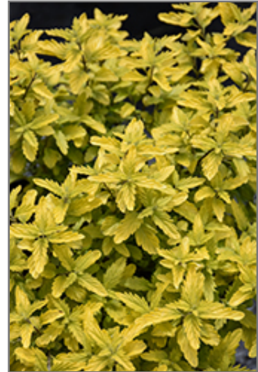
Sunshine Blue II Caryopteris foliage

Sunshine Blue II Caryopteris makes a fine choice for the outdoor landscape, but it is also well-suited for use in outdoor pots and containers. With its upright habit of growth, it is best suited for use as a 'thriller' in the 'spiller-thriller-filler' container combination; plant it near the center of the pot, surrounded by smaller plants and those that spill over the edges. It is even sizeable enough that it can be grown alone in a suitable container. Note that when grown in a container, it may not perform exactly as indicated on the tag - this is to be expected. Also note that when growing plants in outdoor containers and baskets, they may require more frequent waterings than they would in the yard or garden.