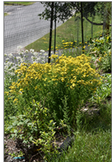
St. John's Wort in bloom