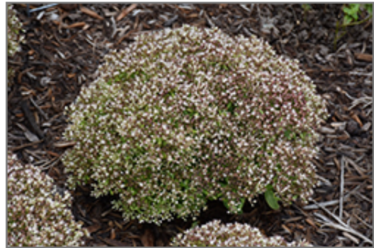
Rock 'N Round Bundle Of Joy Stonecrop in bloom