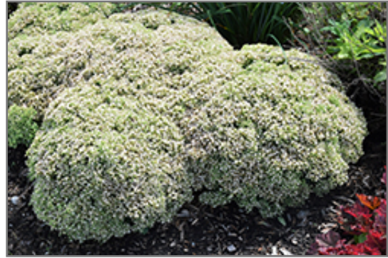
Rock 'N Round Bundle Of Joy Stonecrop in bloom

This is a relatively low maintenance plant, and is best cleaned up in early spring before it resumes active growth for the season. It is a good choice for attracting bees and butterflies to your yard, but is not particularly attractive to deer who tend to leave it alone in favor of tastier treats. It has no significant negative characteristics.