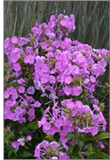
Fashionably Early Flamingo Garden Phlox flowers