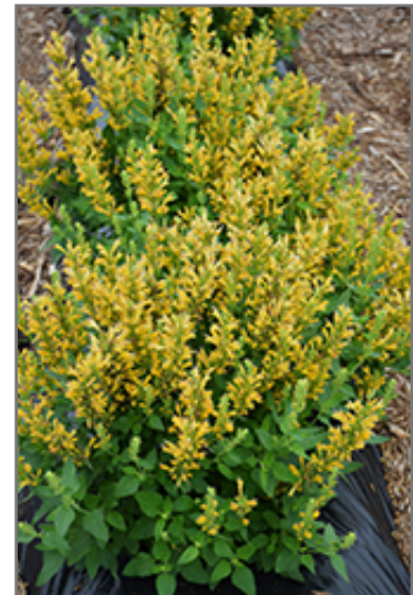
Poquito Butter Yellow Hyssop in bloom