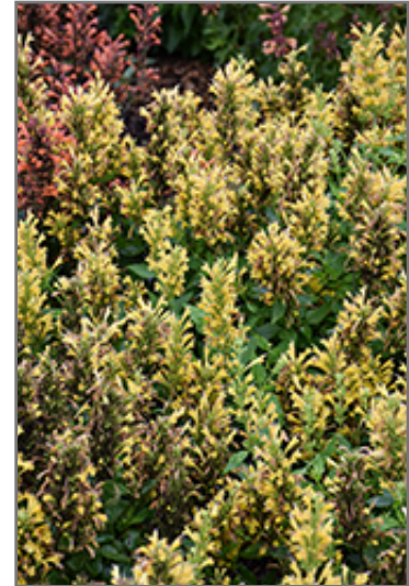
Poquito Butter Yellow Hyssop flowers

Poquito Butter Yellow Hyssop is recommended for the following landscape applications;