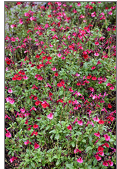
Mirage Cherry Red Autumn Sage flowers

This is a relatively low maintenance plant, and should only be pruned after flowering to avoid removing any of the current season's flowers. It is a good choice for attracting bees, butterflies and hummingbirds to your yard, but is not particularly attractive to deer who tend to leave it alone in favor of tastier treats. It has no significant negative characteristics.