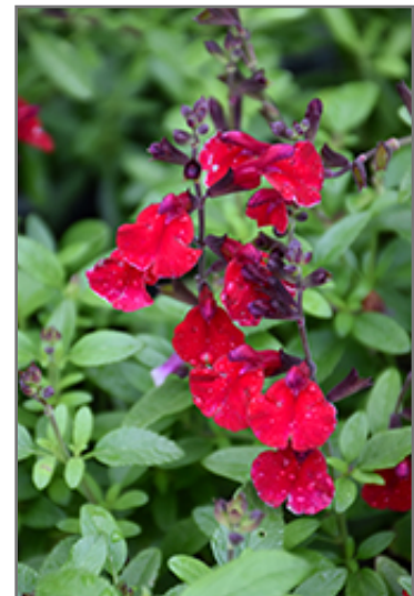
Mirage Cherry Red Autumn Sage flowers