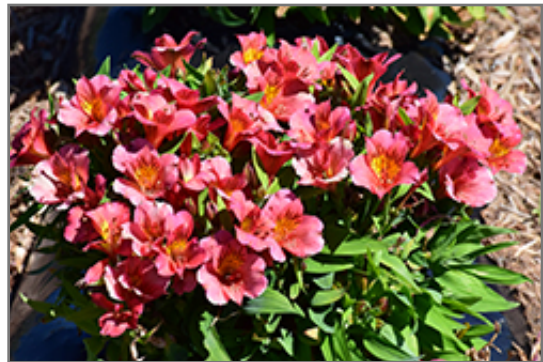
Colorita Eliane Alstroemeria in bloom