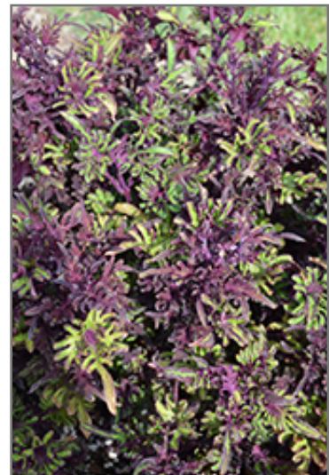
Under The Sea Lime Shrimp Coleus foliage