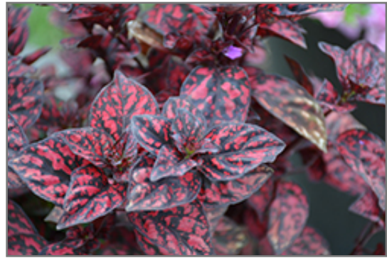
Hippo Red Polka Dot Plant foliage

Hippo Red Polka Dot Plant is recommended for the following landscape applications;