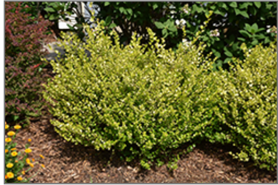
Cesky Gold Dwarf Birch