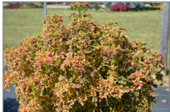
Under The Sea Copper Coral Coleus