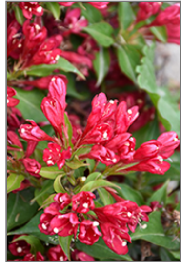
Crimson Kisses Weigela flowers