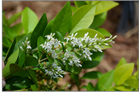
Golden Ticket Privet flowers

This shrub should only be grown in full sunlight. It is very adaptable to both dry and moist locations, and should do just fine under average home landscape conditions. It is not particular as to soil type or pH, and is able to handle environmental salt. It is highly tolerant of urban pollution and will even thrive in inner city environments. This particular variety is an interspecific hybrid.