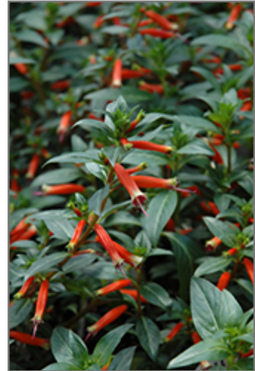
Vermillionaire Large Firecracker Plant flowers

Vermillionaire Large Firecracker Plant is a fine choice for the garden, but it is also a good selection for planting in outdoor pots and containers. With its upright habit of growth, it is best suited for use as a 'thriller' in the 'spiller-thriller-filler' container combination; plant it near the center of the pot, surrounded by smaller plants and those that spill over the edges. It is even sizeable enough that it can be grown alone in a suitable container. Note that when growing plants in outdoor containers and baskets, they may require more frequent waterings than they would in the yard or garden.