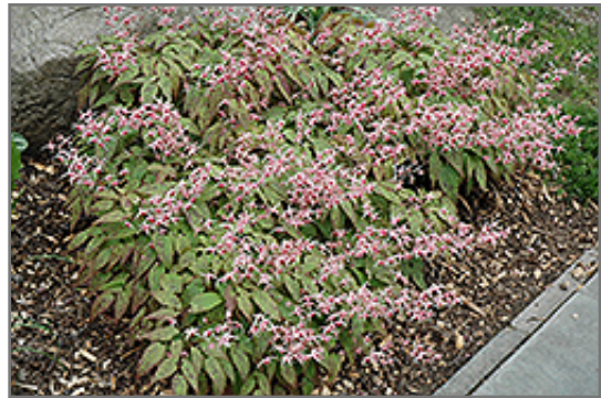
Pink Champagne Fairy Wings in bloom