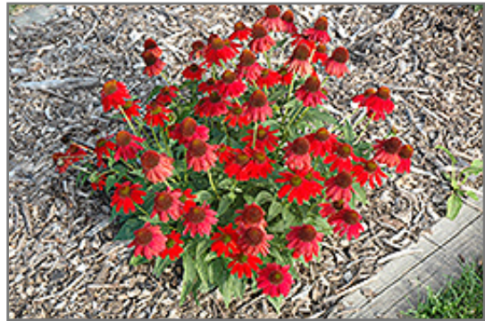
Sombrero Salsa Red Coneflower in bloom

Sombrero Salsa Red Coneflower will grow to be about 16 inches tall at maturity extending to 24 inches tall with the flowers, with a spread of 24 inches. Its foliage tends to remain dense right to the ground, not requiring facer plants in front. It grows at a medium rate, and under ideal conditions can be expected to live for approximately 10 years. As an herbaceous perennial, this plant will usually die back to the crown each winter, and will regrow from the base each spring. Be careful not to disturb the crown in late winter when it may not be readily seen!