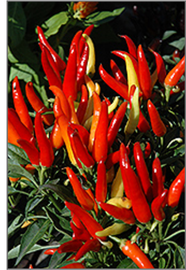
Chilly Chili Ornamental Pepper fruit

Chilly Chili Ornamental Pepper is an herbaceous annual with an upright spreading habit of growth. Its medium texture blends into the garden, but can always be balanced by a couple of finer or coarser plants for an effective composition.