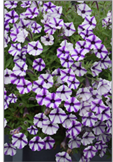
Supertunia Mini Vista Violet Star Petunia flowers

Supertunia Mini Vista Violet Star Petunia is a dense herbaceous annual with a trailing habit of growth, eventually spilling over the edges of hanging baskets and containers. Its medium texture blends into the garden, but can always be balanced by a couple of finer or coarser plants for an effective composition.