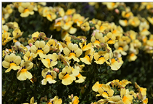
Nesia Inca Nemesia flowers